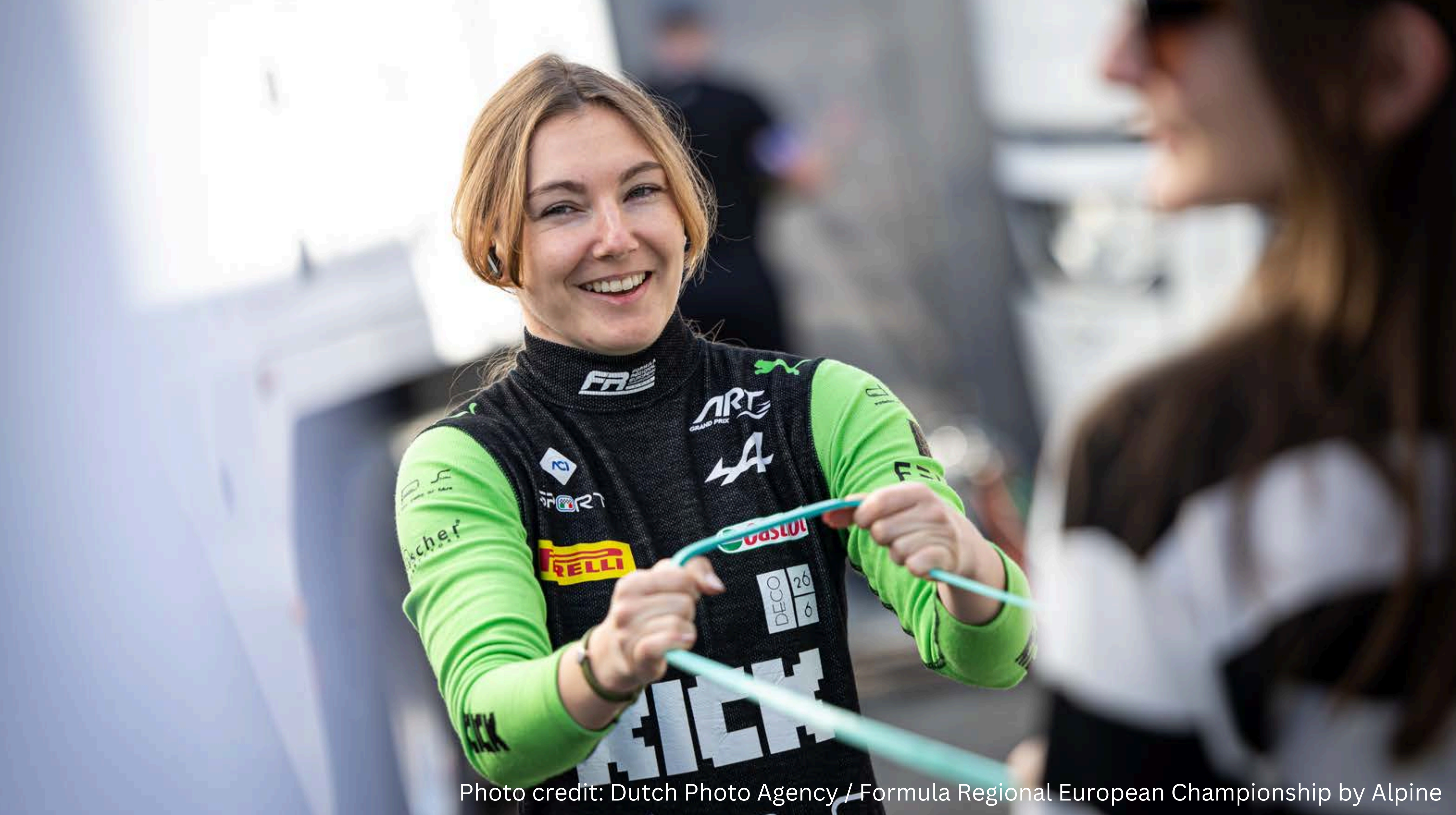
Photo credit: Dutch Photo Agency / Formula Regional European Championship by Alpine